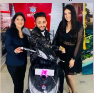
Heydo Corporation, Karnal

Mother's love is paradise, it is harmony, it need not be attained, it need not be earned. It is divine, selfless. That's why they are mothers. God could not be every where so he created mothers, their care and comfort is celestial. It is like a blessing; We cannot ever thank them enough, for their love and affection that tey bestow on us every day. They are our first best friend and the person we constantly seek guidance from. Mother's Day is an excellent opportunity to express our gratitude for all the mothers in the world.