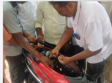
Divek Elctro World, Punjab