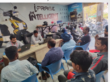
GR Green Life EV Motors, Pune