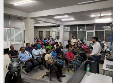
Navin Automobiles, Ahmedabad