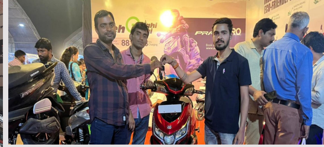
Vinayak Motors, Dehradun