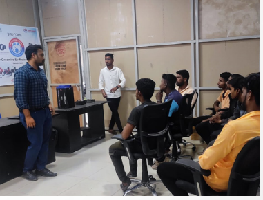
Amby Motors, Chennai