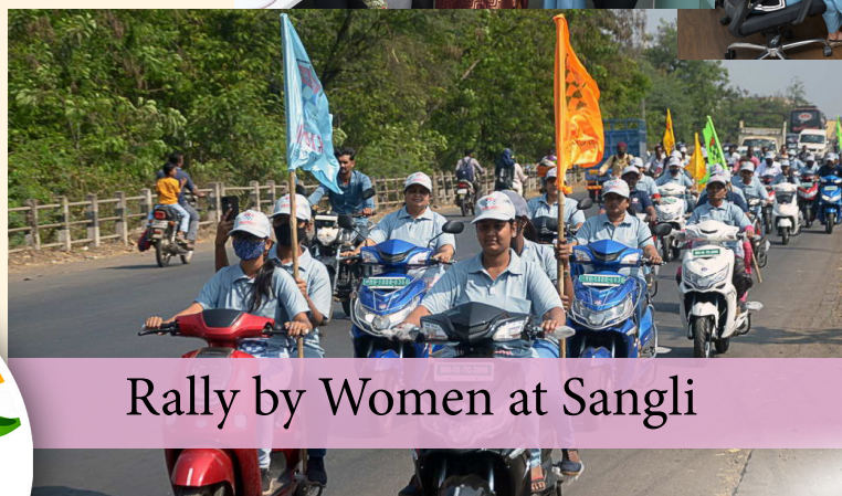
Rally by Women at Sangli