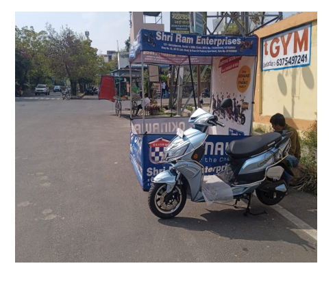
The Ramsons Motors, Ranchi