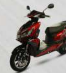
Glossy Red Black