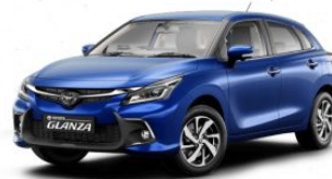
2022 Toyota Glanza Facelift: Top 5 things you need to know