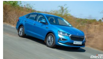
Rising input costs are scary, doing everything to keep them under control: Skoda Auto