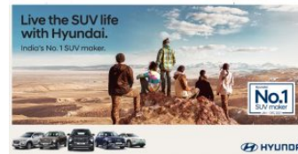
Hyundai India launches new marketing campaign showcasing its SUV portfolio