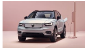
Volvo XC40 Recharge priced at Rs 75 lakh: Leaked via official website